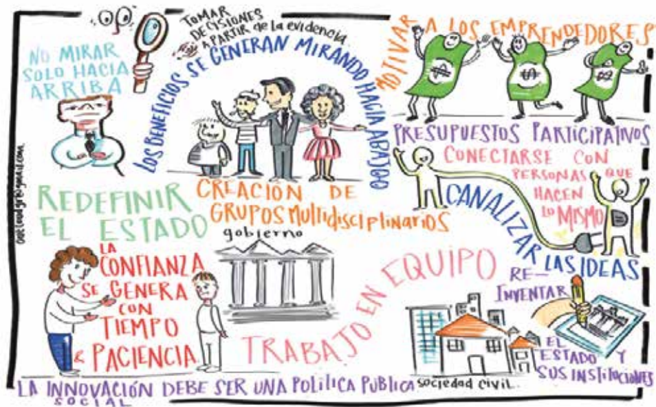
Above: Social Innovation in Practice illustration drawn during 'building momentum for social innovation in Colombia' event

Key examples include Innoweave 28 in Canada, which supports front line staff and practitioners; to the toolkit 29 being developed by Nesta in the UK and Rockefeller Foundation in the US, which brings together effective practical tools for development agencies and organisations who work in this field to use.